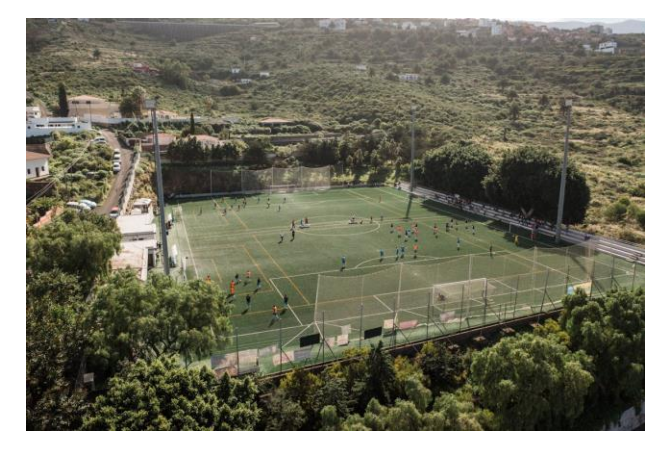
Community Empowerment and Engagement